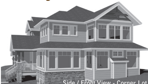
Side / Front View - Corner Lot

2,494 Ft 2 + 2 Storey Home Large Corner Lot