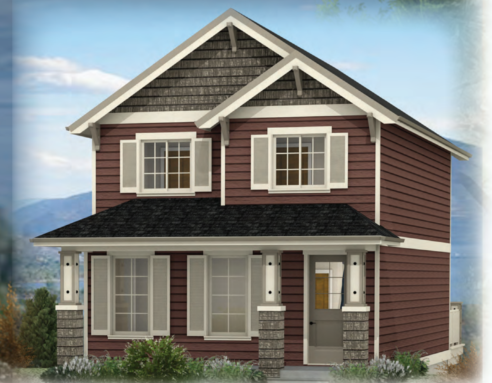
OPTIONAL ELEVATION 'A'

Two Storey Plus Basement (unfinished) Double Garage - Optional Detached, Attached, and Drive Under (Off Rear Lane) 9 Foot Ceiling - main 3 Bedroom | 2 1/2 Bathrooms (inc. Ensuite)