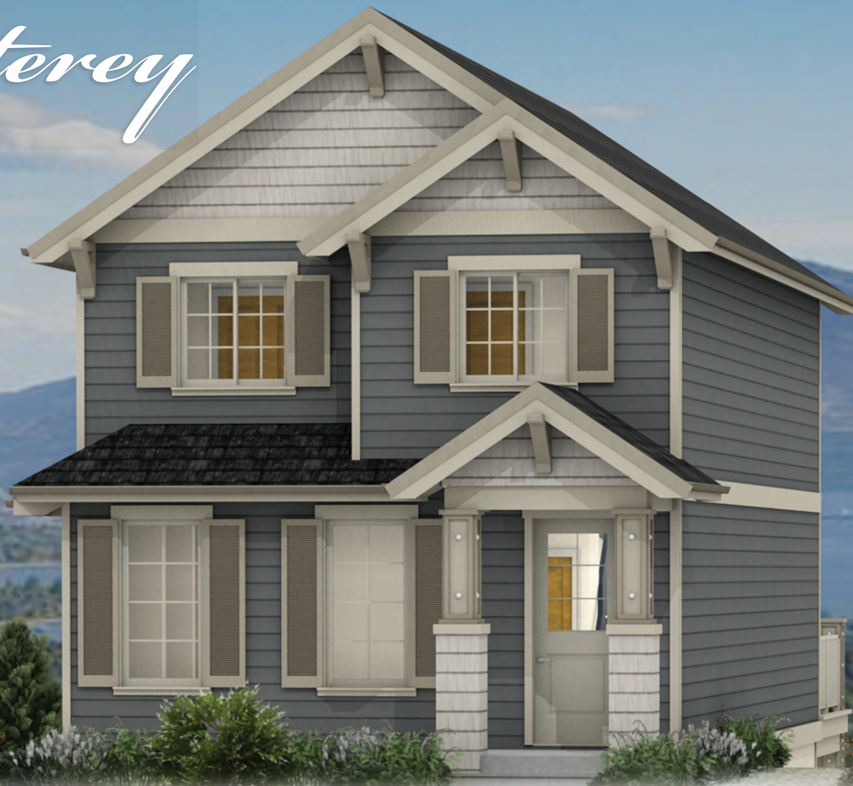
OPTIONAL ELEVATION 'B'

(includes basement, mechanical & stairs)